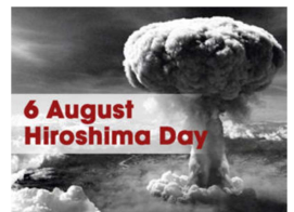
6 August Hiroshima Day

ii. This was the first time in the history of warfare when an atomic bomb was used against a nation. The incident wiped out around 90% of the city and killed around 80,000 people and had left scars on the city even after all these years.